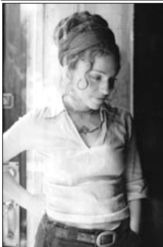
Special to The Voyager

'Educated Guess' offers mix of Difranco's talents.