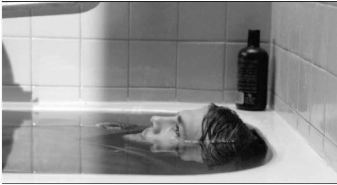
Special to the Voyager

Little does Evan know, "Change one thing, change everything." In an effort to ease the pain of his fellow friend's childhood, Evan changes the present and ultimately changes their futures by altering events in their past. Just when Evan thinks that he has made everything right and everyone is happy, something goes horribly wrong. In order to make things as