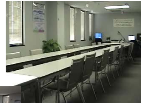
Conference/training area (20 students)