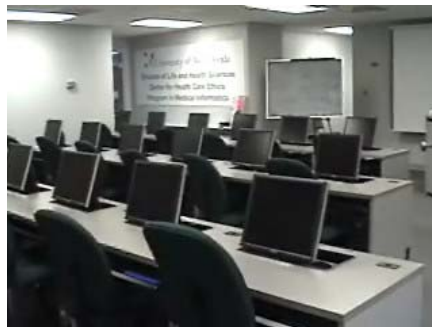
Computer-based training area (20 students)