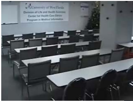
Lecture area (30 students)