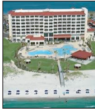
(Above) Hilton Garden Inn on Pensacola Beach

We expect approximately fifty colleges and universities from the southeast to be represented. We are pleased to extend to you the invitation to participate in our conference as a vendor. This will provide college mail managers the opportunity to meet representatives from your company, to obtain product information, and to see demonstrations of the latest technology in the mailing industry.