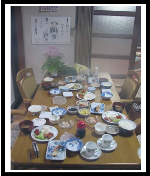
Dining table at the Kaneko family home.