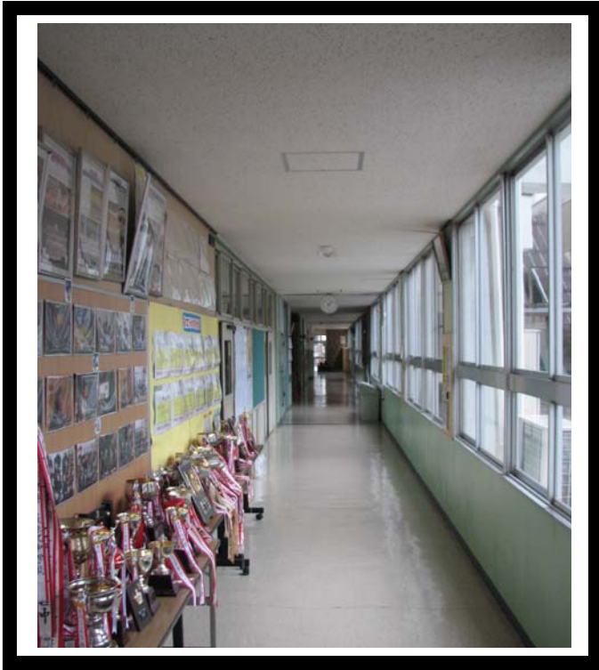
Gero Junior High School