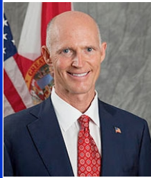
The Honorable Rick Scott, Governor, State of Florida

The next annual SEUS/Japan joint meeting will be held fall 2012 in Tokyo. Contact us for further details.