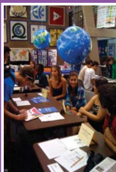
Above: Exchange students from Europe assist a prospective study abroad student.

The Study Abroad Fair, held on Sept. 17, offered students a chance to discover opportunities and gather information from a range of study abroad representatives. Student representatives from our partner schools, program providers, and UWF representatives from various departments were on hand to discuss study abroad options and procedures. Table displays featured photos, videos, brochures and catalogs to help students better understand the programs.