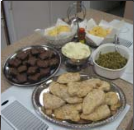
Right: the final product of these Honors students' hard work. Who knew volunteering could taste so good?