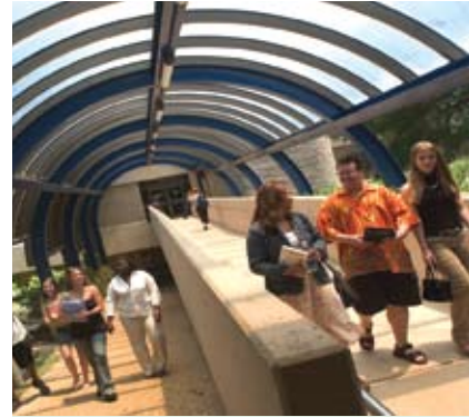
Students at the College of Business.

For more information on the UWF College of Business, visit uwf.edu/cob .