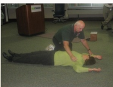
Participants learn recovery positions for victims.