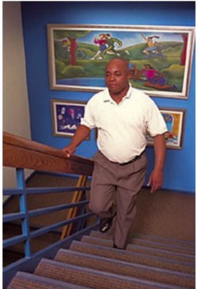
An employee takes the stairs as part of the CDC's Healthier Worksite StairWELL Initiative.

Find out more about the Healthier Worksite Initiative at http://bit.ly/d1tPEN .