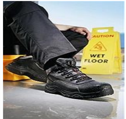
Proper shoes can help reduce slips, trips and falls.

If the project is successful in reducing slip, trip and fall claims, it will be recommended to all other agencies and universities.