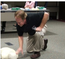
A Safety Coordinator attends to a victim.