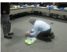
Students get hands-on training with using the AED.