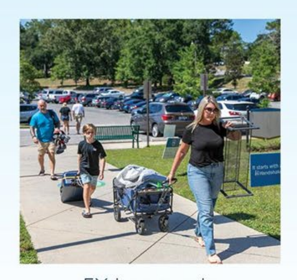
5X increase in parent and family participation