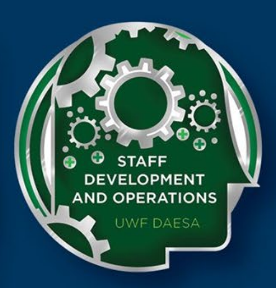
Staff Development and Operations