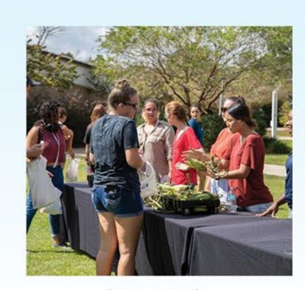
Increase in Care Services