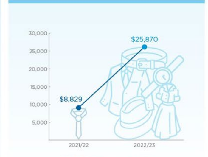
193% increase in Suit Up donations