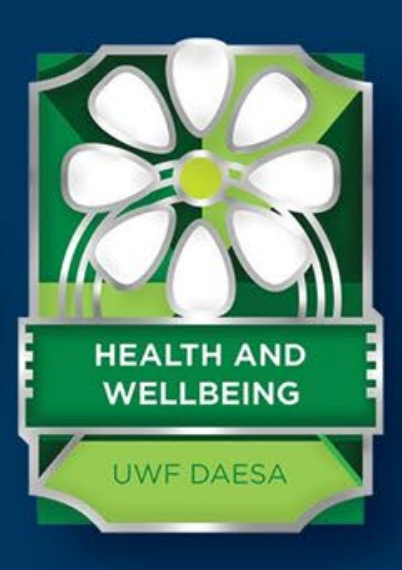
Health and Wellbeing