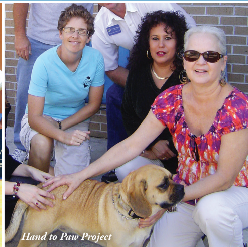
Hand to Paw Project