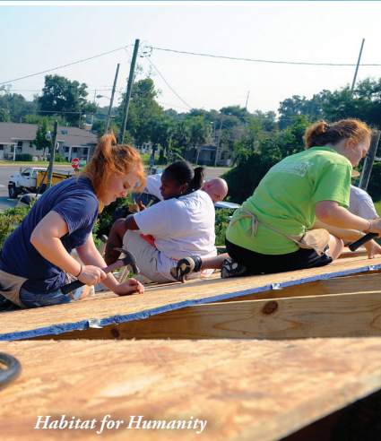
Habitat for Humanity