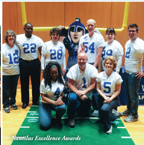
Nautilus Excellence Awards